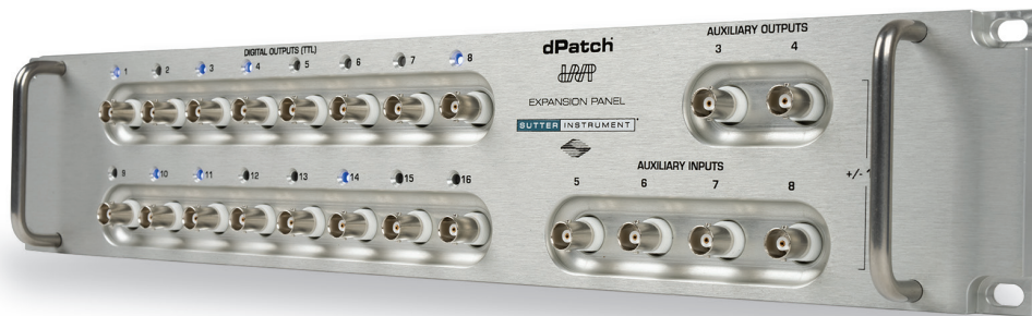
Shown: DPATCH-PCH expansion panel